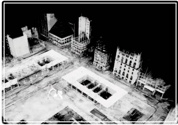
EdgeWise Building automatically extracted polygons from 500 scans of the Chicago Federal Center.