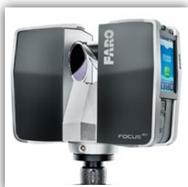
FARO Focus 3D